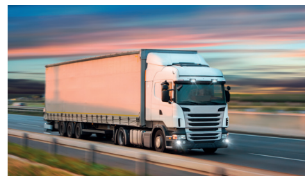
Application example: shutterstock